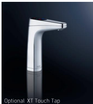
Optional XT Touch Tap