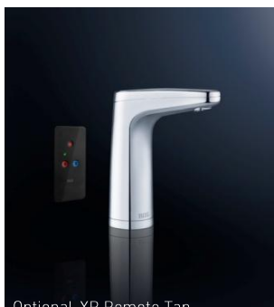
Optional XR Remote Tap