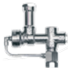
Float-Free Rain/ Mains Valve