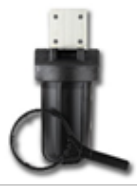
Taste and Odour Filter