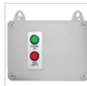
Low Tank Pump Shutoff